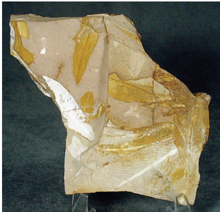
Fossilized Glossopteris leaves

What is the evidence that the continents have moved?